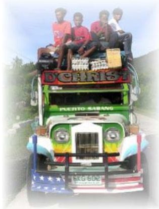
In the province Jeepneys are often filled way above what we would consider capacity

Fares are only a few pesos and should be paid for with P5 and P10 coins. Any bills larger than P50 will be difficult to pass but if you are travelling by jeepney then you are probably experienced enough to know this. Be wary of any jeepney that pulls up and there are no women inside, just two or three men. These are often set ups or pick pockets. Preferably take a jeepney in company with a local, at least until you get a feel for the place and where you are going.