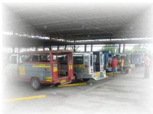
Terminal at Large shopping Mall – you would find your route then wait for it to fill

The destination and route are painted on the sides and across the front and in some cities there will also be a route number. The jeepneys ply specific routes and while you can get on and off anywhere you like along this route, they do stay on their assigned path. Simply signal the driver with a wave or even just eye contact, many will already have slowed down in anticipation of you wanting a ride anyway.