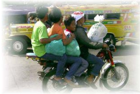
This is a Taxi Service which is much faster to most other alternatives in city Traffic

In the provincial back blocks and also parts of some cities you will come across motorcycle taxis, or ‘Habal-Habal’ as they are called in the Visayas. Sometimes the only form of transport to where you wish to go is on the back of a screaming 110cc step through driven by last year’s Moto GP second place getter.