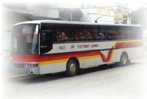
One of the larger bus lines with modern aircon buses

There are three main types of bus used in the Philippines. In Manila they have big, old, dilapidated ex-Taiwanese buses that clog up EDSA the main ring road. They park three and four deep and pull out as and when they choose, belch smoke and are generally uncomfortable. But they are cheap.