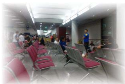
Inside the new Terminal in Manila – modern and comfortable

The airline industry in the Philippines is far safer than many third world countries and that is in no small part due to the influence of the USA since flying began in the 1920s. American trained air and ground crews have been the rule for both the Philippine Air Force and the various civil carriers.