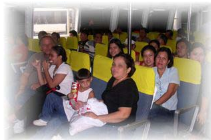
Seating inside a Ferry Service

Many Filipinos can't swim and it is not unusual to see whole families of drowned passengers recovered, clinging to each other in death as they would have in life. Tragic and poignant and to us, very avoidable. However many Filipinos are fatalistic due to their catholic faith and worse, many of the smaller shipping lines overload their vessels and carry insufficient PFDs (life jackets). Those they do carry are cottage industry made affairs consisting of a couple of pieces of Styrofoam in an orange cover that are simply too small for the average westerner to fit into.