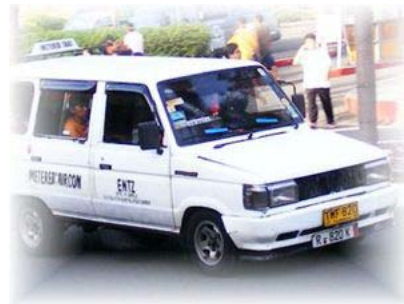
Tamaraw Special FX taxi service – Popular in Luzon

Like taxis or jeepneys they can be flagged down anywhere along their route and usually have the route painted on the side or on a sign on the windshield. They cost more than the few peso's of the jeepney but nowhere near as much as a cab.