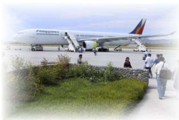
Philippines Airlines – Provincial Airport

Statistically around the world flying is the safest way to get from one place to another. Even in third world countries where aircraft maintenance may be akin to the criminal in its negligence level, it is still safer to fly in and out of there than it is to drive.