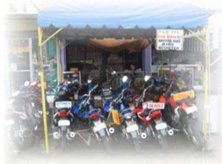
Motor bike hire in Angeles City – 300 to 600 a day depending on size and age of bike

Renting a motorcycle and riding off on an adventure or two is one of the great freedoms you can enjoy in the Philippines. Although most of the rental bikes will be less than 250cc, you can rent more powerful bikes in Angeles City and other tourist areas. The bigger bikes (over 400cc) are allowed onto the Northern and Southern Luzon Expressways whereas the smaller bikes have to use the local roads.