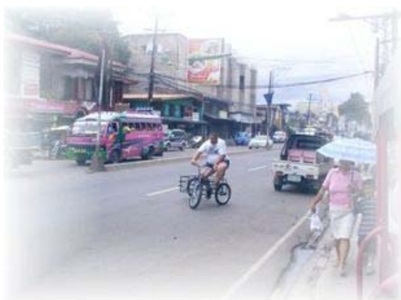
We take research seriously - Perry test driving a pedicab. This one is typical of those used for delivery services – see sidecar

Statistically the tricycle and pedicab are quite safe, if you consider how many there are and the sheer number of people they move every day compared to accidents or fatalities. Trikes are a motorcycle and sidecar ensemble and pedicabs (also called trisikads) are the push bike equivalent. In different parts of the country they have different names and the styles of sidecar vary even from province to province.