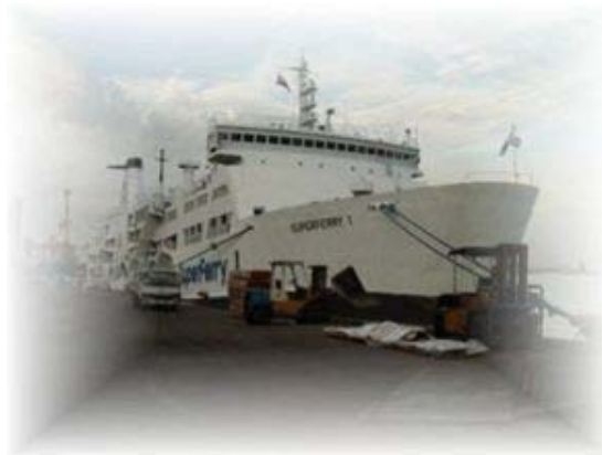
Super Ferry – Safety has improved significantly over the last decade due to highly publicised Ferry disasters with great loss of life. First class cabins on longer trips are available and some even have discos and karaoke

They do sink though, even the largest of them. One was also the target of terrorists a few years ago and bombed while more recently one sank in heavy weather when its captain should have headed for shelter but instead he elected to continue the scheduled journey.