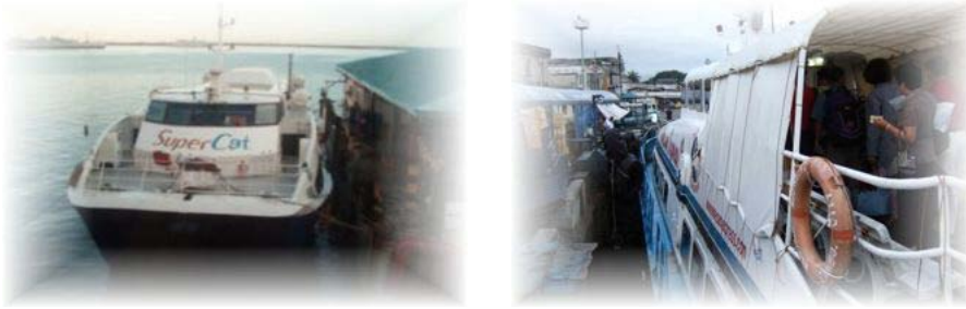
Fast inter-island Services

There are many 'Jet Cat' fast services available from island to island such as Cebu to Bohol and Leyte. These vessels are fast, fairly modern and usually well maintained. The terminals are similar to airport terminals and security is usually pretty good by local standards. The journey often takes an hour or two compared to several hours or even overnight by regular services.