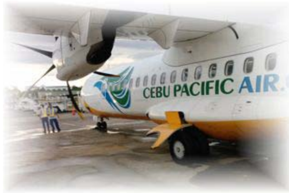
Cebu Pacific – now international with a modern fleet, this is a smaller domestic flight

The benefit of flying PAL is that you can fly into Manila from the USA or elsewhere and then remain in the same terminal, NAIA 2, to connect to a domestic PAL flight if need be. With other airlines and connections you need to shuffle between terminals NAIA 1 and NAIA 3 or the old domestic terminal and that might require an over priced taxi ride if there is no shuttle bus available (usually ever 20 minutes for just P20, less than fifty cents).