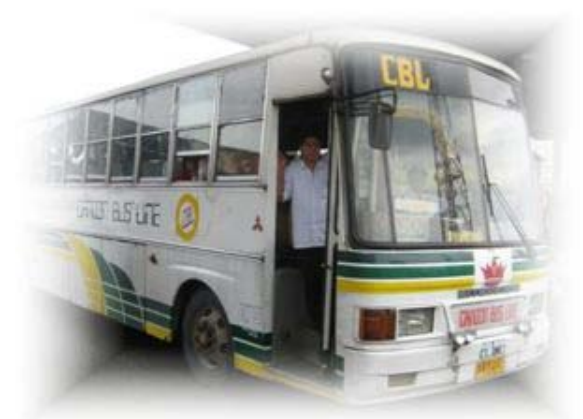
Older bus services with no aircon are often only a little cheaper but to many locals it's a huge price difference.

There are three main types of bus used in the Philippines. In Manila they have big, old, dilapidated ex-Taiwanese buses that clog up EDSA the main ring road. They park three and four deep and pull out as and when they choose, belch smoke and are generally uncomfortable. But they are cheap.