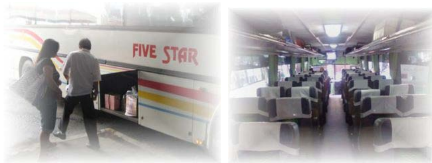
Luggage on buses is one thing I often feel nervous about – I try to sit by the window at least until the bus departs to make sure mine is not removed... On longer trips there is will a movie often with the volume set to an uncomfortable level.

I have seen people hit by these buses as they careen around the roads at top speed. I have heard several stories of drivers reversing over the injured to make sure they are dead. It is cheaper to pay compensation for a funeral than forever paying out for hospital care and loss of income. I have seen injured people dumped on the floor of the bus then literally dropped off outside the next rural hospital with the bus driving off even before the victim's family can get off the bus to call for help.