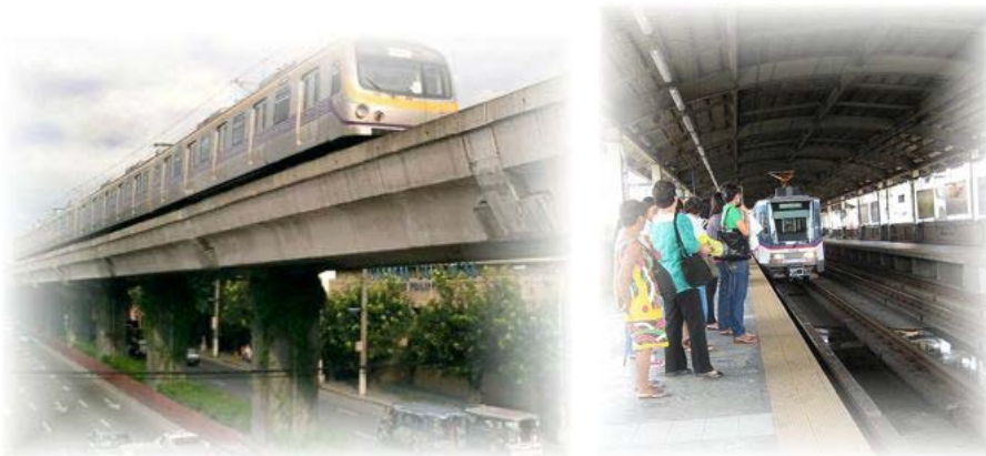
Manila - LRT on left and MRT on right

The only rail options left in the Philippines are the LRT and MRT light rail system in Manila. There used to be trans from Legaspi to Manila but so much of the track was stolen that eventually there was a major train crash and hundreds died and the service was halted. The line running through Makati and Manila is lined with squatter's shanties that have been deeded to them by the President in what some claim was a pointless and totally vote grabbing exercise.