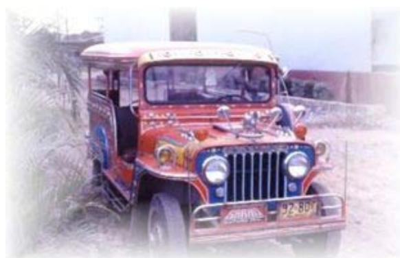
This is a classic Jeepney which has become an icon for the Philippines

The iconic public transportation vehicle of the Philippines can be seen everywhere. In some towns, such as Olongapo the are colour coded. The brown ones go one route and the green ones the other. In Manila they range from basic to extremely ornate and tastelessly decorated with plastic horses, bells, lights, horns and tassels. Sometimes you wonder how the driver can see out the front windshield as it will be framed by tassels and covered in glued on CDs.