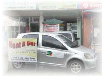
You can rent a car with or without a driver

There are the usual big name car rental companies in Manila, Hertz and Avis and others and they do rent cars you can drive yourself. However they prefer to rent a car and driver and when you see the traffic and the roads you can understand why. There is nothing like the freedom of your own vehicle and a driver who will take you wherever you want to go and wait patiently while you enjoy the sights, then drive you home.