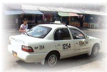
Typical taxi in the Philippines

While taxis are no more safe than any other vehicle on Philippines roads, they are probably the most used form of transportation the average tourist or visitor will use. Today nearly all are air conditioned and in Manila there are those that work the upscale areas such as Makati and Taguig that can even provide a printed receipt telling you how long the journey took and how far you travelled.