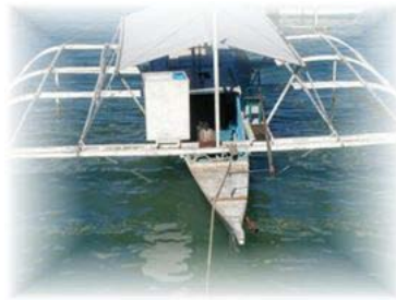
Pump boats – Multiple use including fishing, diving, snorkelling, island hopping

Pump boats, also called bankas, are outrigger boats that range in size from 30 feet long with an 8hp lawn mower engine (see photo above of the author's banka) to over 100 feet long and powered by a diesel truck or car motor. They can be single or double decked and carry everything from motorbikes to pigs to sacks of rice and piles of building materials as well as people. At Holy Week (Easter) and All Saints Day (1 Nov) they are too often overcrowded and can easily sink if they encounter heavy seas.