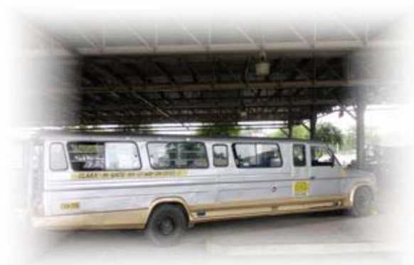
When does a Jeepney become a small bus? This one travels between Angeles and San Fernando