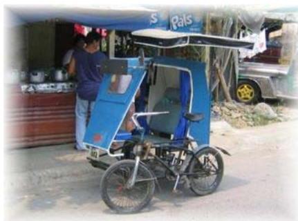
Typical Pedicab Service usually found in the back streets of cities and towns

The pedicab is used for short journeys, usually from the main road to the house stuck somewhere up a dirt road or in the middle of an estate. Some have room for two people but others might be larger. You will also see many cargo pedicabs that carry everything from your garbage to the entire stock of a roadside clothing stall.