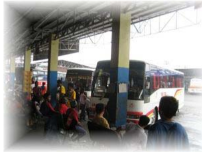
The bus depot – busy and full of hustlers. Not a place I would like to be alone late at night but otherwise safe (just watch your pockets)

Each bus line will patronise a particular rest stop where there will be a bakery and food outlet as well as toilet facilities. These will range from filthy to disgusting and be paperless, flushless and often overflowing. Away from the major cities gas stations are few and far between and too often have no facilities at all, so plan your journey and your toilet needs. You know you are getting close to a rest stop when the garbage on the other side of the road thins out. People tend to throw their peeling and packaging out the window as they consume the items bought at the rest stop. So the first kilometre or so there is less garbage as they are all still busy eating whatever they just purchased.