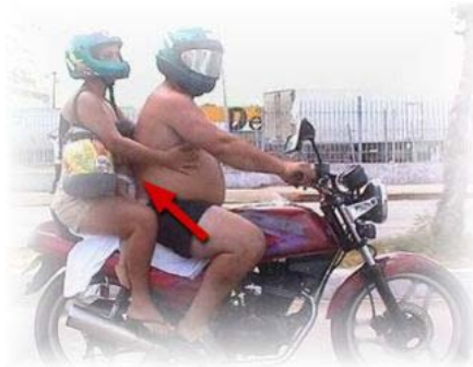
Yes that is a small child in between the couple on the bike!

Ambulances exist only in the big cities and even then are rarely called to a crash scene. Well meaning by-standers will hail a passing jeepney or taxi (or even a truck), literally throw the injured on the floor or seat and then scream off for the nearest hospital and hope they arrive before the passenger dies so they can get paid.