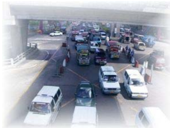
FX's and Jeepneys on EDSA near Cubao

You can negotiate a special trip price with a V-Hire driver and rent the entire vehicle. You can then offer rides and take fares from other travellers if you wish or simply enjoy the space and comfort of having the whole van to yourself.