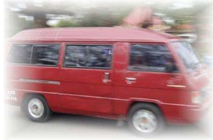
V-hire is popular in Cebu and the Visayas including provincial travel as an alternative to buses and Jeepneys

V-Hires are mini-vans that travel provincial routes and carry up to 14 people in a vehicle we would never use for more than 10 or 11. They are air conditioned and ply a set route from a city to a provincial destination and while faster and more comfortable than buses (especially if you pay for two seats or a whole row) the drivers are no more skilled or safe than any other on the roads.