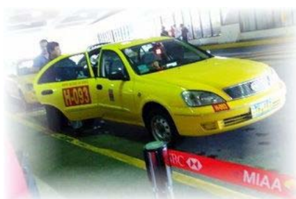
Manila Airport Taxis – a little expensive but safe! If you know what it used to be like then you will appreciate the new system

While taxis are no more safe than any other vehicle on Philippines roads, they are probably the most used form of transportation the average tourist or visitor will use. Today nearly all are air conditioned and in Manila there are those that work the upscale areas such as Makati and Taguig that can even provide a printed receipt telling you how long the journey took and how far you travelled.